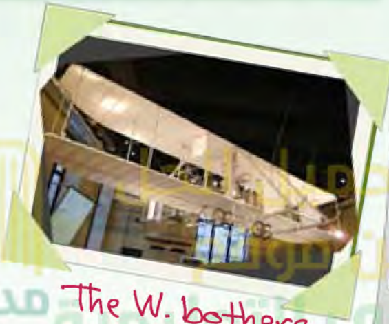
The W. brothers