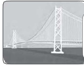
Akashi-Kaikyo Bridge: opened 1998 / 282 metres high / 3910 metres long

5 Complete the dialogue between an estate agent and a potential homeowner. There are more expressions than you need.