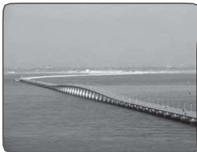
King Fahd Causeway: opened 1986 / actually a series of bridges and dam / 2500 metres long