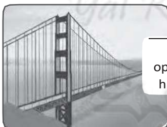
Golden Gate Bridge: opened 1937 / 261 metres high / 2743 metres long